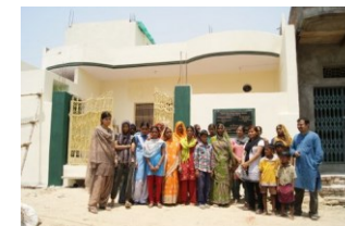
Women Centre „Savitri Bai Phule“

On February 28, 2012, the Women's Centre "Savitri Bai Phule" was inaugurated in the Indian village of Baghwanala. It is an educational protection and cultural centre for Dalit women, that aims to empower girls and women by self-awareness and strengthening their roles as women in the family and society.